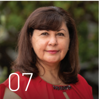
PLANNED GIVING Honoring the Legacy of the Sisters Gifts of Real Estate