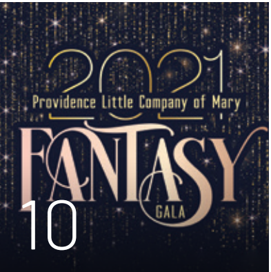
EVENTS The Event Was Imaginary, The Need Is Real