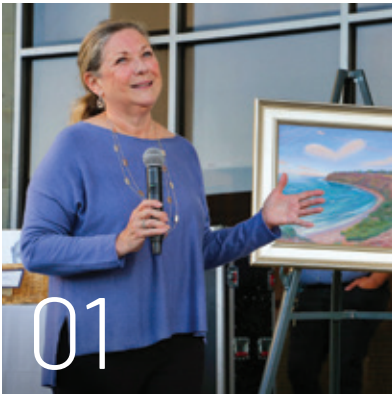
COVER STORY A Volunteering Vocation