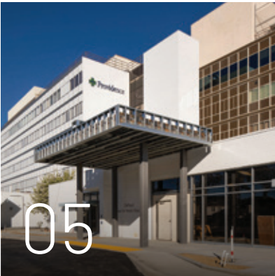
FUNDRAISING UPDATE Emergency Response – San Pedro