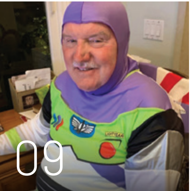
HOSPITAL NEWS Celebrating Superheroes