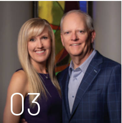
DONOR STORY Compassion & Expertise Inspire New Donors