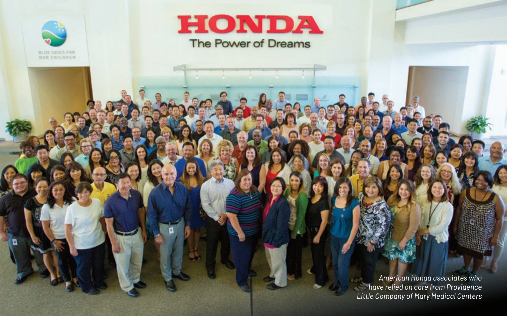
American Honda associates who have relied on care from Providence Little Company of Mary Medical Centers