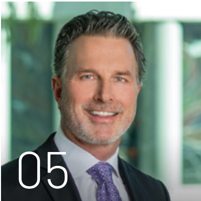
ANNUAL REPORT Your Impact